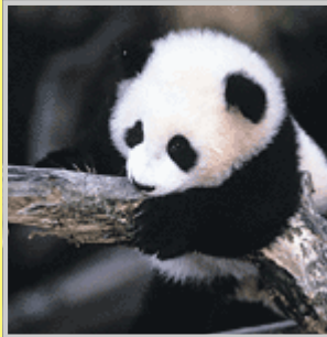
San Diego Zoo

Balboa Park is a San Diego must-see just minutes from downtown, and ranked as one of the best Parks in the World. The Park is home to fifteen major Museums, several performing arts venues, more than eight lovely gardens and many other cultural and recreational attractions, as well as the San Diego Zoo.